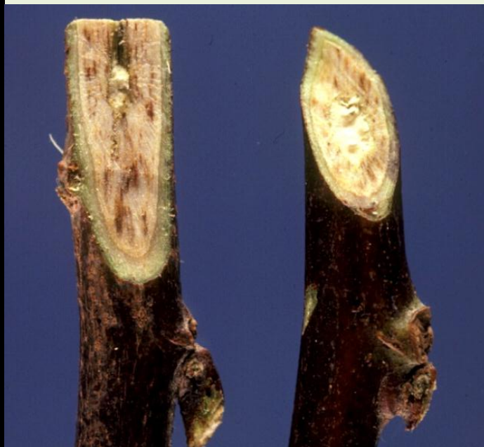
Verticillium wilt FUNGUS - ( Verticillium dahlia )