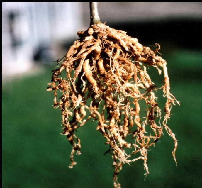
Root knot nematodes NEMATODE - ( Meloidogyne incognita )